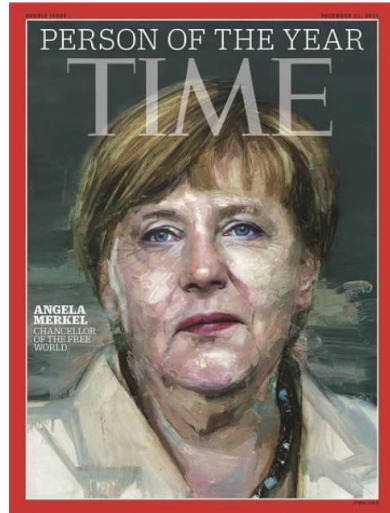
Angela Merkel (In Absentia)

In December 2015 he was commissioned by TIME Magazine to paint the German Chancellor, Angela Merkel, for the cover for its 'Person of the Year' issue.