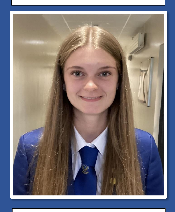
DEPUTY HEAD BOY